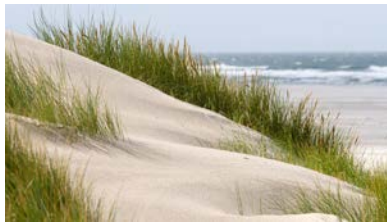
Floreal Club, Blankenberge, Belgium

The Belgian Association for Sleep research and Sleep medicine (BASS) announces the next edition of the International Sleep Medicine Course (ISMC) .